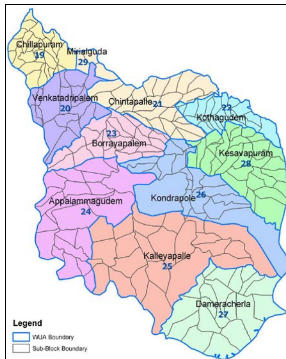
Figure 2. WUA and canal/ block & sub-block boundaries in GIS environment.